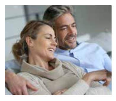
08 TAXING TIMES

PROTECTION SOLUTION Helping you feel confident your family's finances are secure